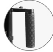
Comfortable, adjustable rubber handgrips allow for portability

E-image Q100 TWIN is designed to fit two monitors up to 9" ,featuring rubber handgrips, a padded neck strap, and V-LOCK battery mount with dual-B interfaces, covers with multiple 1/4" and 3/8" mounting threads, this cage makes carrying monitors and accessories simple and comfortable.