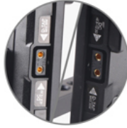
V-lock battery mount comes with two B interface at the both sides