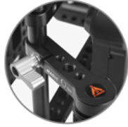
Covers with multiple 1/4" and 3/8" mounting threads