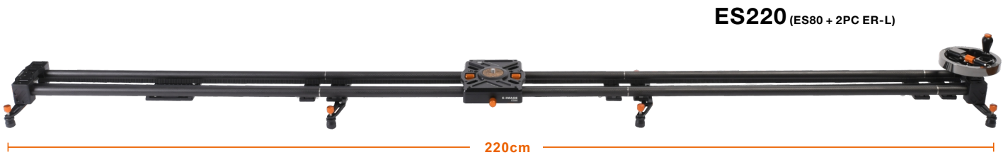
ES220 (ES80 + 2PC ER-L)