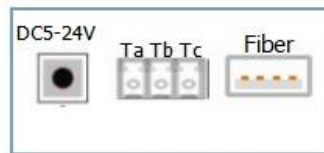
HD-SDI Optical Transmitter