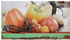
Wide Type Waveform

All SDI1,SDI2 and HDMI support Waveform, Wide Type Waveform, Waveform Alarm, Vectorscope, Histogram, Pixel Measurement, Audio Meter display and other professional picture analysis functions.