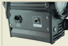
D-LFS series DC 24V Input Connector

This series of high-definition fresnel spotlight apply to all types of television studios, interview lighting, films lighting and television shows, theaters, large arena, museum sports stadium, indoor and outdoor architectural lighting and all kinds of largescale performances.