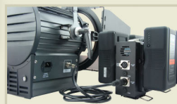
Dynacore D-4BS/A extender supply power to D-LFS series LED Fresnel Spot Light through 24V output