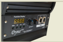
D-LFS series Control Board