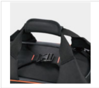
Ergonomic carrying handle.