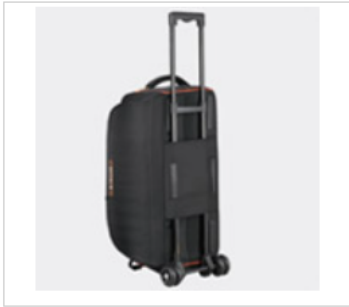
The bottom design is suitable for trolley (EB-0909).