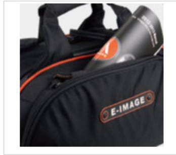
Interior and exterior pockets for accessories.