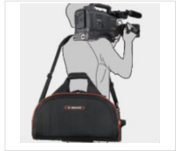
Built-in and durable wheels make traveling easy.