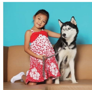
with Fill Light™