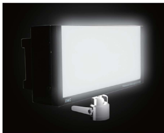
ENG Camera Lights with ball head