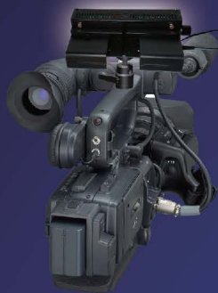
Run on general battery