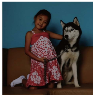
without Fill Light™

16 million color virtual studio easily remote