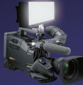
ENG camera lighting