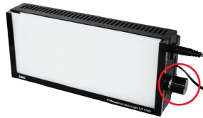
256 levels dimmable use the knob