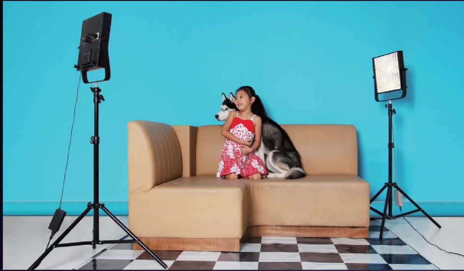
Studio / Interview lighting

HD Shooting | Camera Mounted | Stage | Interview | News | Broadcast